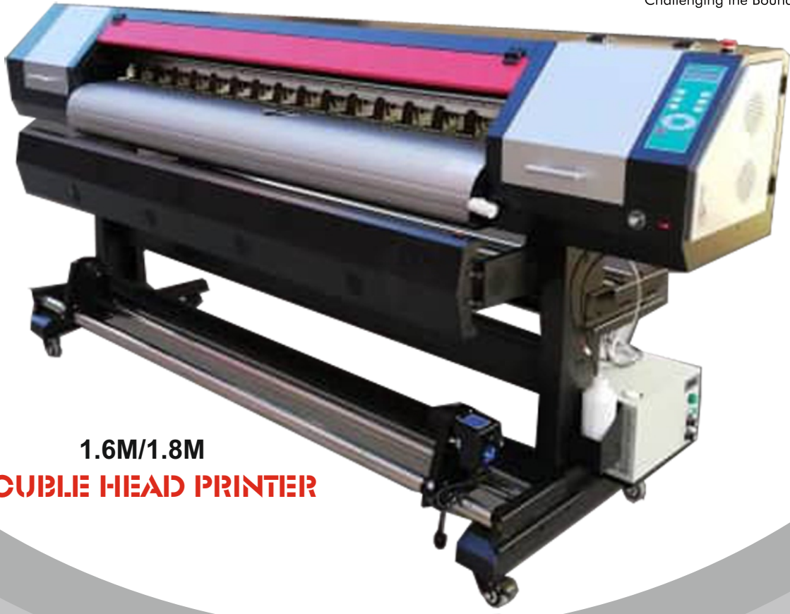
1.6M/1.8M DOUBLE HEAD PRINTER