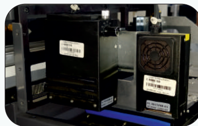
Dual UV Lamps for White, Colour and Varnish