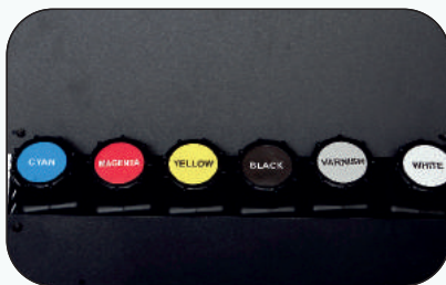
Ink Supply System